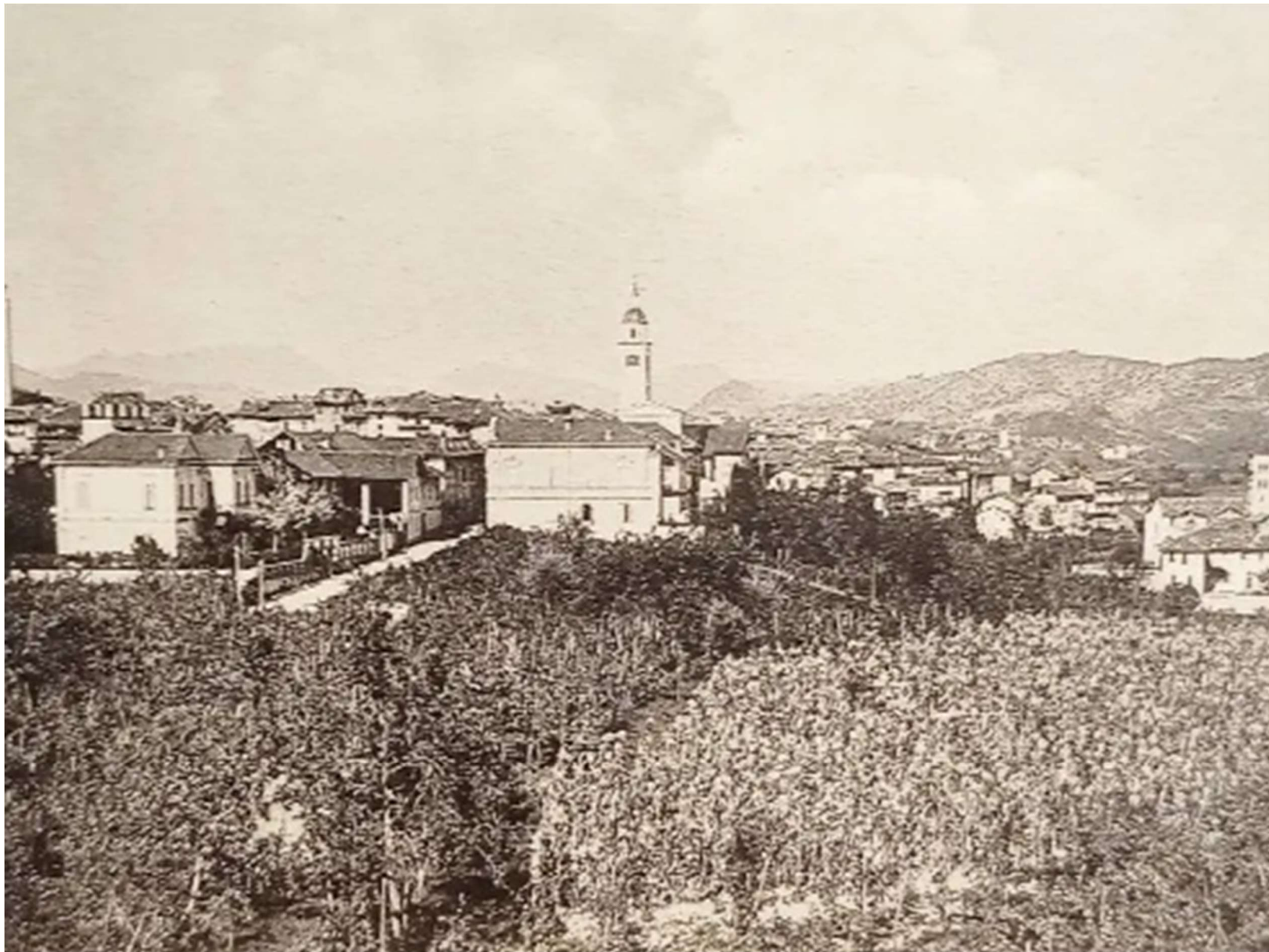
A vintage photo of Masserano (circa 1930's). This vintage photo inspired the label design for Melascone and Vispavola.